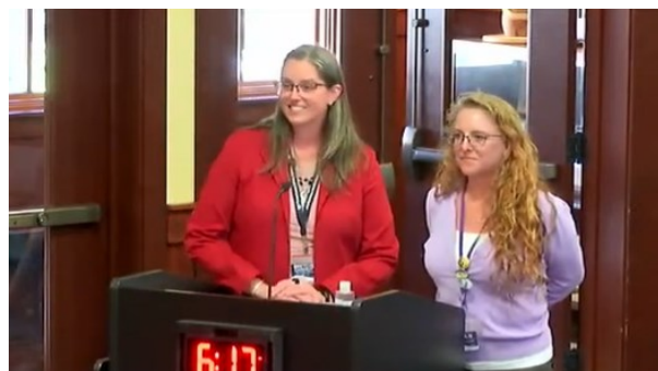
Pierce County Library 2023 Annual Report to DuPont City Council

The presentation can be viewed here: 2024-07-09 Regular Council Meeting (youtube.com)