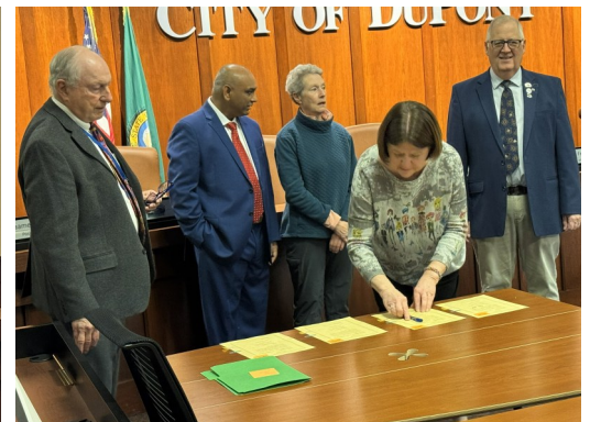
Dec. 30, 2025, signing of oaths